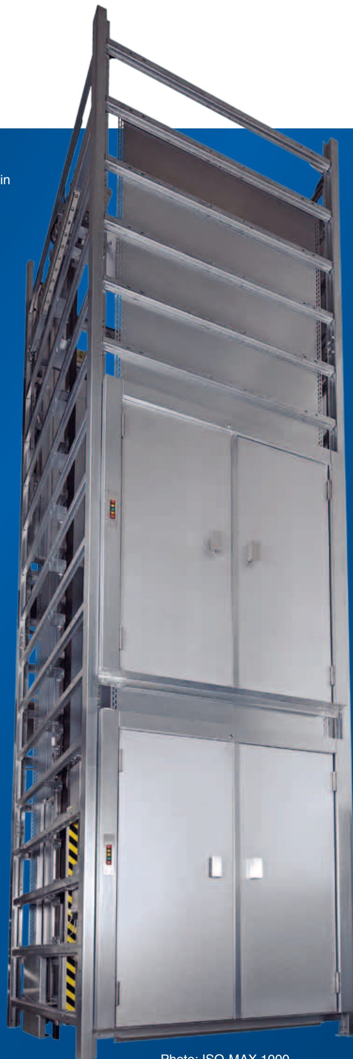
Photo: ISO-MAX 1000

Doku.-Nr. D-19-305E 09/2011 Layout: vielbauch.de